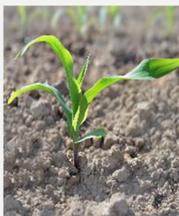
Figure 1: First sampling stage