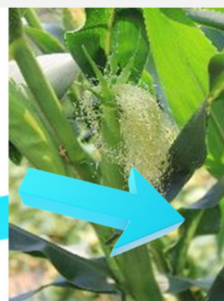
Figure 3: Third sampling stage