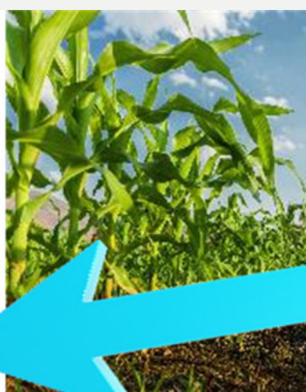
Figure 2: Second sampling stage